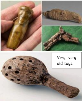
Very, very old toys.

Children from rich Victorian families played with toys such as rocking horses, toys soldiers and dolls.