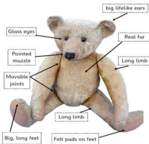
General appearance: lifelike