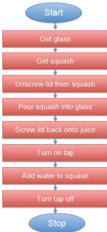
A flowchart displaying an algorithm for making squash